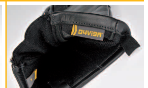
Bonded nylon liner.