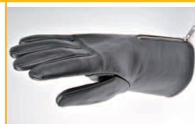
Single piece construction.