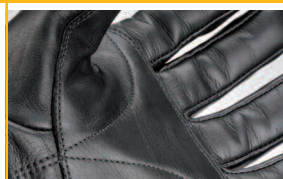
Kevlar thread throughout.